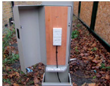
A typical SDP cabinet

Please note suitable pre-formed cabinets are available for purchase from various suppliers.