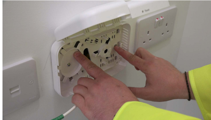
Attaching horizontally to a double back box